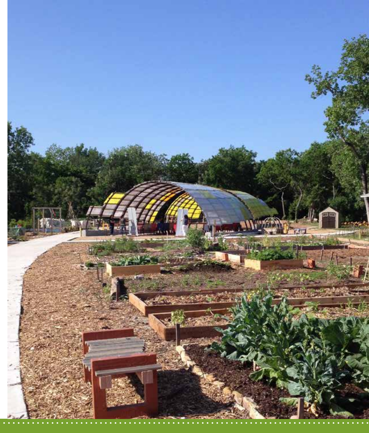
TEACHING GARDEN & PAVILION